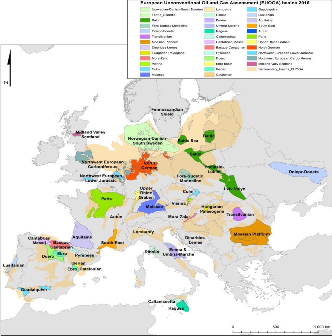
Figure 1 European Unconventional Oil and Gas basins as identified in the EUOGA assessment.

Carlo) method. For gas-bearing shale formations the amount of free gas as well as the amount of adsorbed gas has been estimated. For oil-bearing shale formations the amount of free oil has been estimated. Note that if a formation is classified as either gas or oil only this type of hydrocarbon is calculated although in reality it is very likely that both are present. No recoverable volumes are calculated due to the lack of successful shale operations in the EU which inhibits realistic estimates of recovery factors.