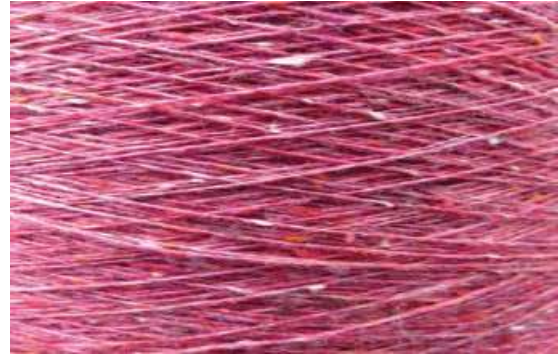
Reclaimed fibres from post-consumer textile waste and re-spun into new yarn