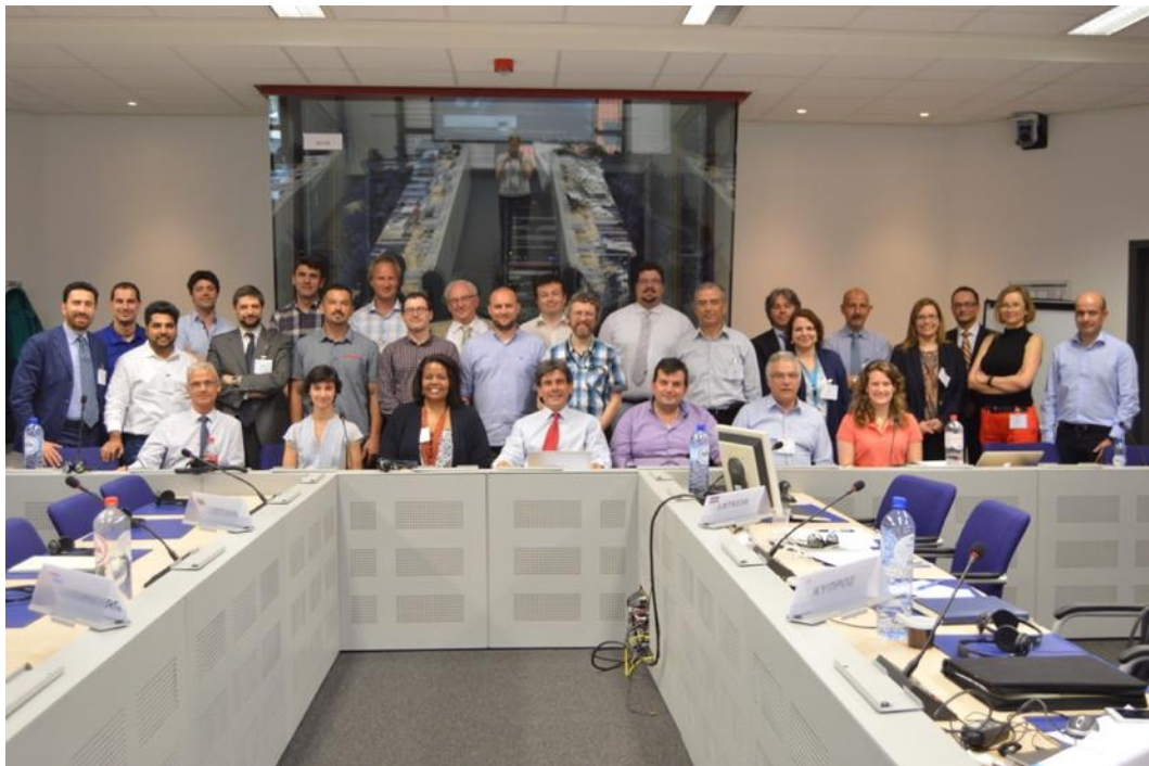
Figure 1. Some participants in the ERNCIP pilot course for professionals in critical infrastructure protection

The course materials could also be used by DG Migration and Home Affairs as one of the actions put in place to foster the improvement of the 'external domain' of the EPCIP. The fact that the EPCIP also aims at reaching out to neighbouring countries of the European Union, with a view to establishing CIP-related forms of cooperation, puts the course among the most useful and direct tools to be exploited to achieve such an objective.