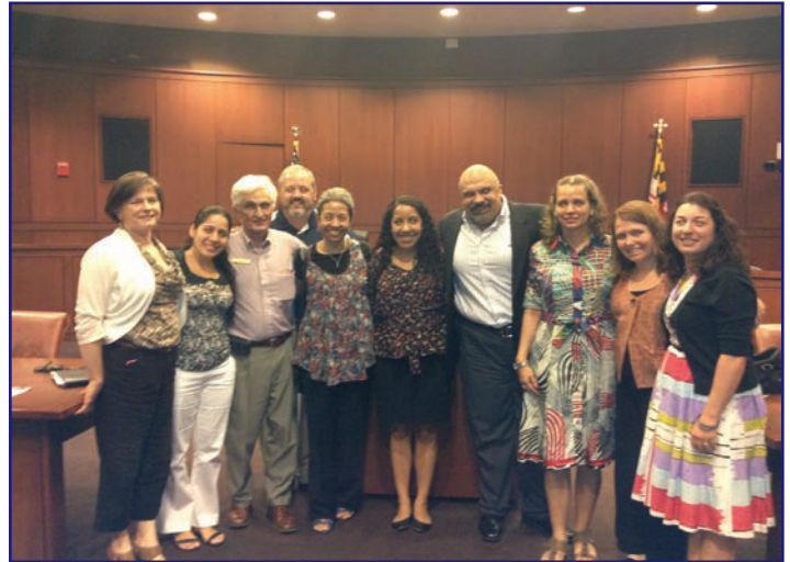
Professors from the University of Antioquia and representatives from Maryland Carey Law during their visit in May 2013.