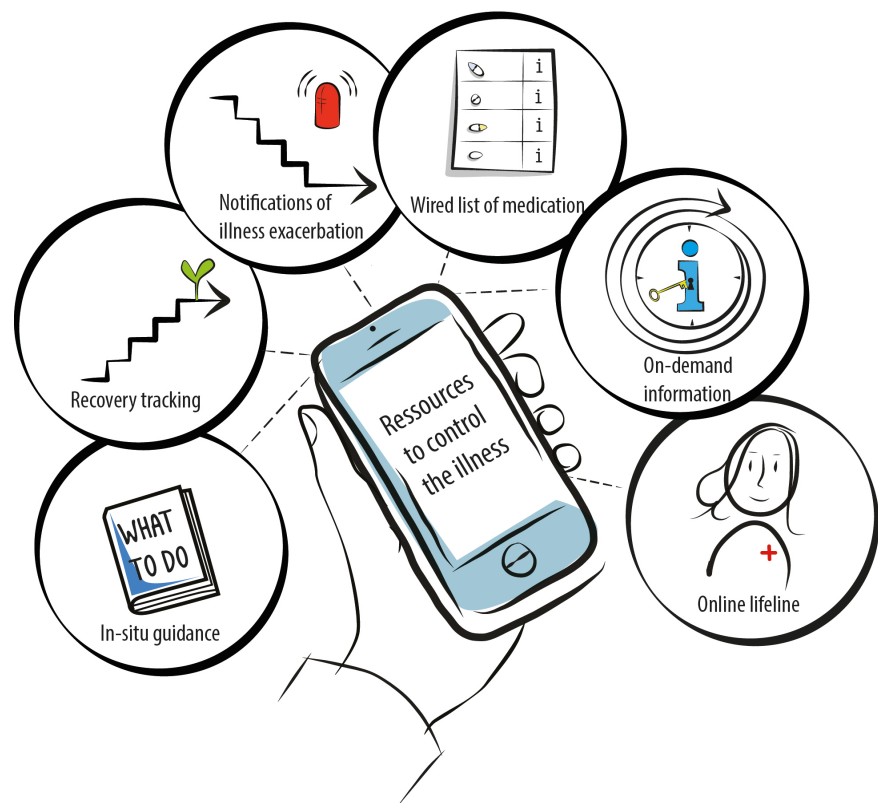
Figure 3. Synthesis of findings.

The findings presented here provide new insights into the users’ perspectives on the needs of support when being young and recently diagnosed with schizophrenia, including potential features that should be considered in designing a smartphone technology to accommodate these needs. Our study highlights that a smartphone technology should be designed to promote empowerment while responding to the needs required to confidently navigate this new life situation.