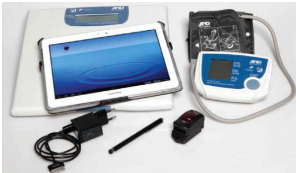
Figure 2: A Telekit that consists of a tablet, tablet pen, pulse oximeter, blood pressure monitor and a scale.

The tablet had two applications (apps) installed: First, a measuring and monitoring application containing health-related questions that also could collect and transmit the measurements made by the peripherals. From this application, the patient could also create an overview over historical measurement values and gain access to a message function that allowed for an asynchronously dialogue with a healthcare professional. Second, a training-application containing a digital version of the manual, several videos showing how the various parts should be used and a training video targeted the patient (108). The device was portable but could only be used inside Denmark (108). The provided tablet could be updated and managed