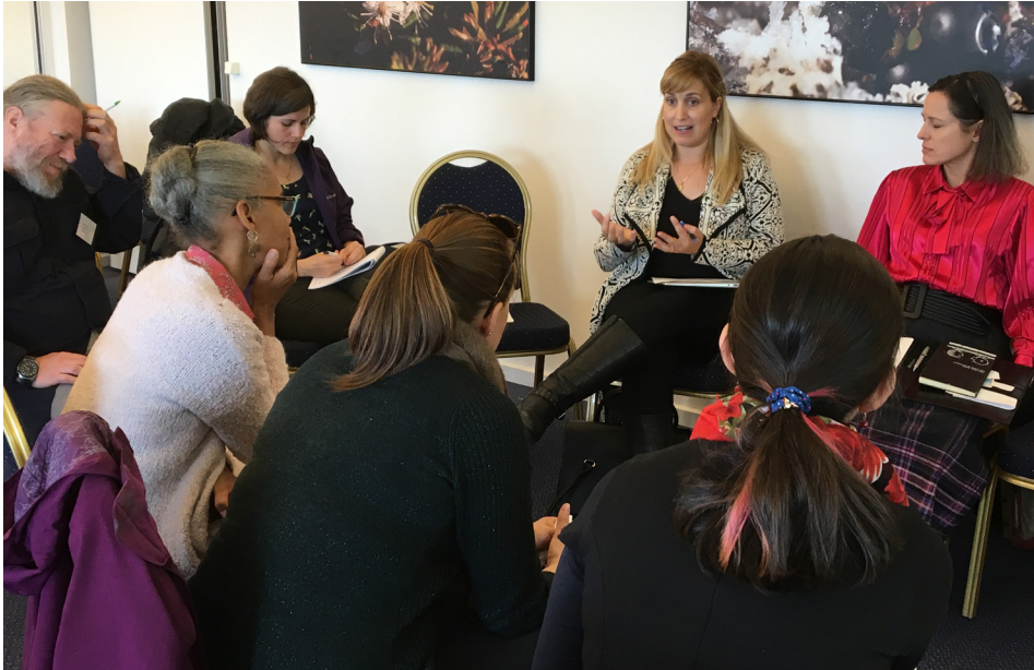
Photo 7, Group One

The concept of public housing meant very different things according to the country of origin of the workshop participants. In some countries, public housing generally has a stigma attached to it (this refers to the assumption that you are poor and that you do not care about the housing, since you are not its owner). The concept of housing is thus very context dependent. It was mentioned that it is very important to create venues such as this workshop, so as to be able to learn from each other and take new knowledge home, to share it with the community leaders in each Arctic country, and to create awareness about the problems and potential solutions that also were part of life in neighbouring regions.