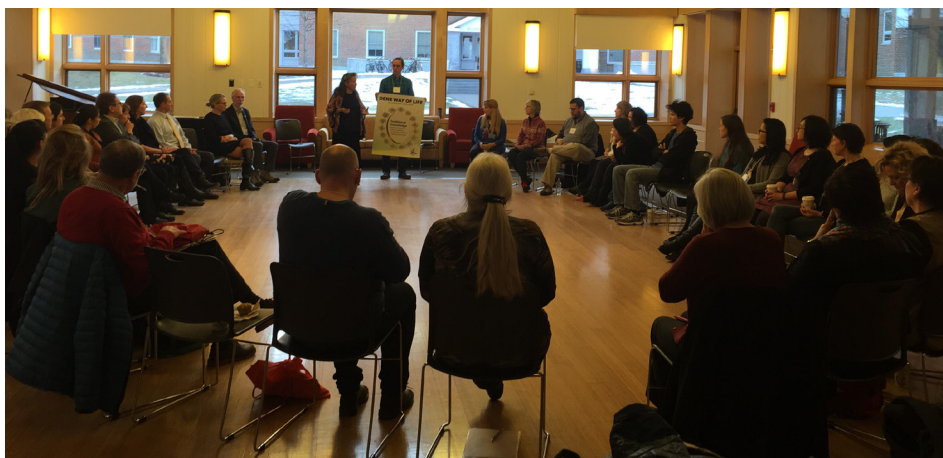
Photo 2. Talking circle, during seminar in Dartmouth

A seminar at Dartmouth College was held in January 2016 6 . The seminar brought together additional experts and community perspectives on health care and delivery, infrastructure challenges, youth engagement, and traditional knowledge. The Dartmouth seminar was a consensus seminar featuring facilitated panel discussions by experts, breakout sessions, and non-traditional and holistic approaches, including a traditional Dene talking circle, to ground the academic discussion in the shared, first-hand experiences of community members and health care providers. The key determinants of community wellbeing that were identified included human capacity-building and local training, cultural connection, trauma, access to health care services, and self-determination.