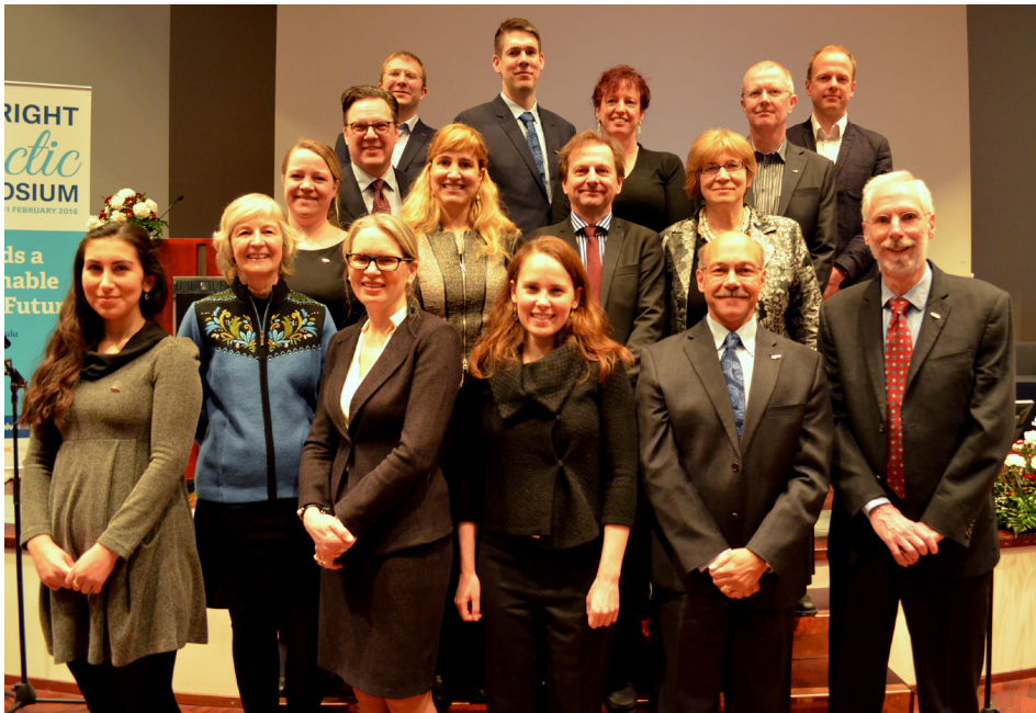
Photo 1. The Fulbright Arctic Scholars

Three working groups were established, on water, energy, and health and infrastructure, and bringing together 17 scholars from the eight Arctic countries.