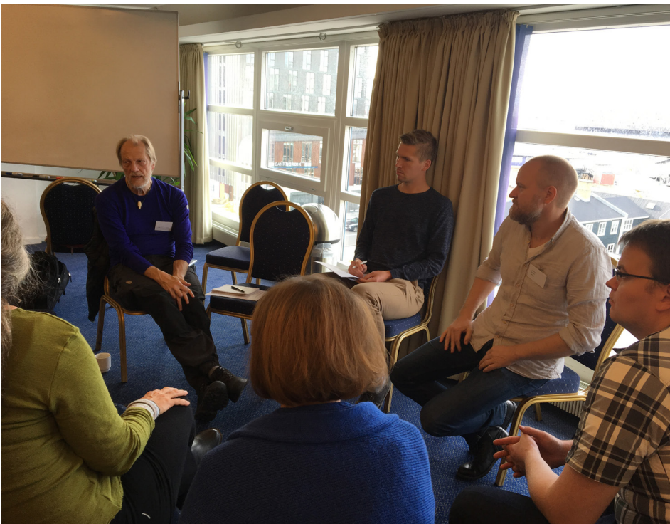
Photo 8, Group Two

The topic of self-determination arose in different ways. The group discussed how people make active choices, in such a way that the same things are not necessarily important to all. In other words, people are able to make choices according to priorities. There was much discussion about the factors that cause people to leave or stay in a community, and about the potential for conflict between individual self-determination and community self-determination.