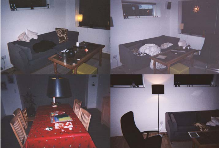
Fig. 1 Kasper Living room and kitchen-dining area

The photos above (Fig. 1) show where Kasper felt most comfortable and most at home, in the living room and the kitchen-dining area. The feelings of comfort and home are entwined; when and where he feels most at home is also when and where he feels most comfortable . In one photo, he was alone reading in the armchair in the living room, the other three show situations with his family 1 . Discussing the pictures, he explained that it is both about the spot in the house, the room, about the furniture that is soft and comfortable, the coffee, Christmas cookies and candles, and about the practices such as reading by himself or relaxing in the company of his family. As such, his feelings of comfort and homeliness are both attached to the material structure of the room and furniture, the bodily sensations, and to the practices such as relaxing or doing social things like watching a film with his wife, watching TV on a weekend morning with his children tucked under the duvet or having the extended family over for a Christmas gathering. To Kasper, feeling comfortable and at home is very much