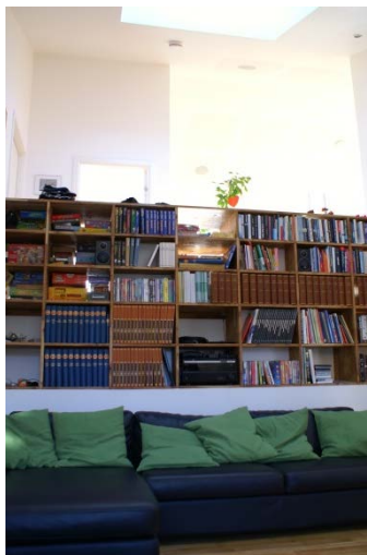
Fig. 5 Jacob Living room

The living room: Relaxing alone and with family