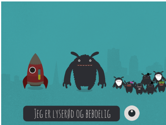
Figure 3. Riddle-based navigation showing the monster character with points in the form of fuels and friends.

the monster has eaten. The monster gives the player feedback and integrates the narrative throughout the game.