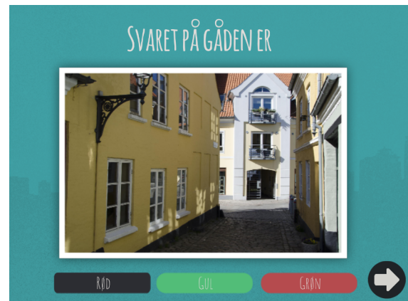
Figure 2. Control question after having found the landmark.

The last game activity is based on riddles and is similar to the game I Spy [32]. Players must spot a specific object in the vicinity based on a clue that is given to them. This approach is inspired by the LBG CityTreasure , where riddles are used at POIs. In the context of landmark navigation, the riddles describe saliency based on the visual, cognitive or structural attributes of the landmark, either in isolation or in combination (E.g. "I am tall and you can see through me"). In order for players to confirm that they have found