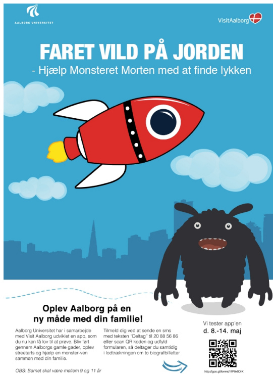
Figure 5. Poster for recruiting participants from local schools.

counterbalanced with the purpose of reducing the environmental effects met on the route on the results. Participants would either begin with map or riddles, and would end with the navigational method different from the one met in the beginning.