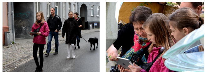
Figure 7. Child in charge of the iPad (left) and parent assisting the child (right)

Figure 7). If there were multiple children, the children not holding the iPad would often have a hard time participating in the navigation and would just follow the group. This indicates that the design does not fully encourage collaboration between multiple players, and it is possible that the collaboration between child and parent naturally arises from the fact that parents are used to assisting their children. During this collaboration however, it was clear that if the riddles were too difficult for the children, but the parents knew the answer, the parents would give their children hints in order for them to solve the riddle. From this, it could be seen that harder riddles encouraged more communication and collaboration.