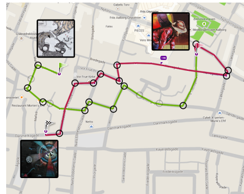
Figure 1. The route between the three street art paintings.

As wayfinding using landmarks is a navigational method that uses objects in the environment, we see potential in using it in combination with game activities between POIs for LBGs. This could result in