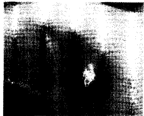
Figure 3: Suppurative BCG lymphadenitis in right axillary region. The lymph node measures 5 cm in diameter, and is fluctuant in centre and the overlying skin is inflamed

(n=4), staphylococcus epidermatitis (n=3), pseudomonas (n=1) and Klebsiella spp. (n=1). Post operatively all the patients were prescribed antituberculous treatment for 6 weeks. Nine patients though advised did not take anti-tuberculosis drugs in postoperative period for various reasons. Two patients had superficial wound infections, and three developed seroma. All patients recovered and did not showed evidence of lymphadenitis or systemic tuberculosis on 6-18 months follow-up.