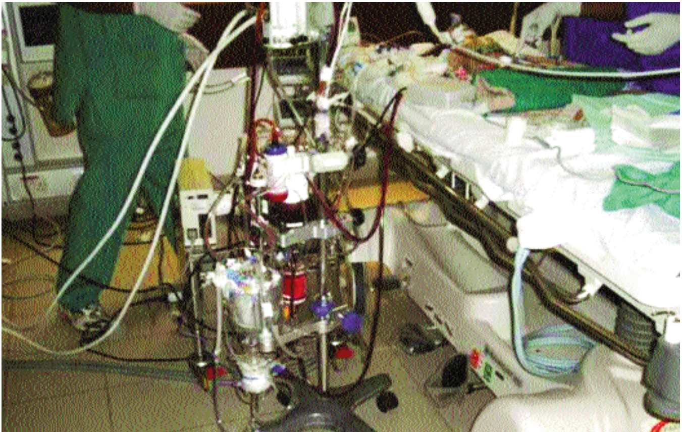
Figure-2: Complete ECMO circuit.