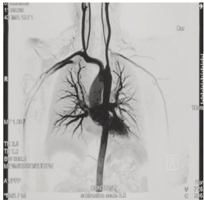
Figure-1: Angiography showing complete left Subclavian stenosis and its refilling via the basilar artery.

A 35 years old male, known case of hypertension, presented with continuing vertigo and symptoms of imbalance for two months duration, blue discoloration and