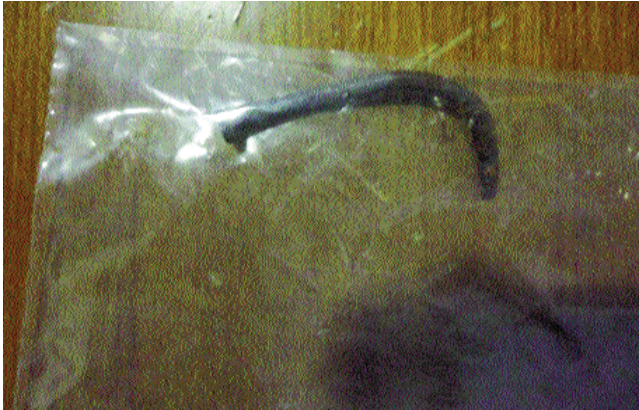
Figure-2: Nail after removal.

comfortably and then was discharged home.