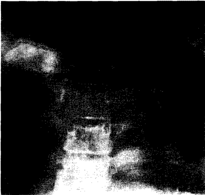
Figure 1. Gastrografin contrast study performed eight days subsequent to thoracic gunshot injury confirmed esophageal perforation; leakage of contrast can be seen on both sides of the thorax (arrows).

perforation, secondary to the transmediastinal trajectory of a projectile. A gastrografin (radiographic contrast) study under fluoroscopic control on the eighth post-traumatic day, confirmed the presence of a perforation of the thoracic esophagus at the level of the third thoracic vertebra. There was leakage of contrast that communicated with the skin through the wound of exit. Surprisingly, on the left side of the chest, leakage of contrast extends down to the level of the left dome of the diaphragm (Fig.1).