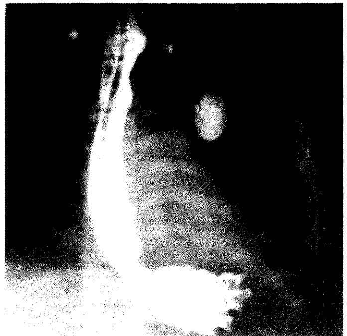
Figure 2B. Repeat gastrografin studies over the subsequent weeks showing progressive decrease in the sizes of the fistulous tracts. These were performed on the fifteenth (A) and the thirtieth (B) post-trauma days, respectively.