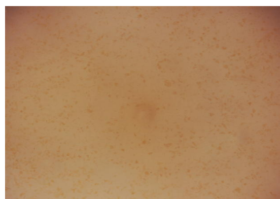
Figure 3: Sample plate at the end of first week (close up view) showing some stratum corneum particles