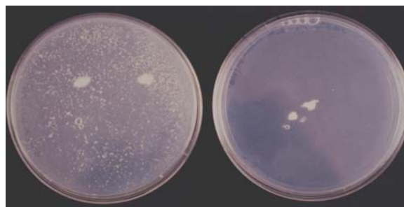
Figure 1: Sample and control plates at the start of the experiment inoculated with an isolate of Trichophyton rubrum .

Figure-1 shows the sample and control plates at the start of the experiment. As can be clearly seen in Figure-2 fungal growth took place only in those plates which contained human stratum corneum particles while there was no growth in the control plates three weeks after initiation. There was a gradual disappearance of stratum corneum from the plates over 3 weeks. Particles of stratum corneum were clearly visible at the end of the first week (Figure-3) but were absent by the end of the third week (Figure-4). This disappearance of stratum corneum particles at the third week which corresponded to the maximum proteolytic activity in the growing isolates. In studies carried out earlier it has been shown that the proteolytic activity is maximum at the third week when isolates were grown on glucose peptone agar plates and their proteolytic activity measured using protein assay. 7