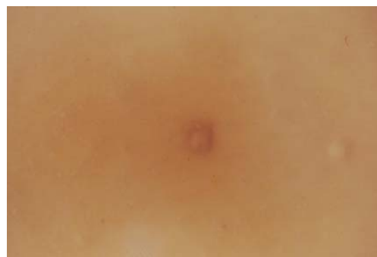
Figure 4: Sample plate (close up view) at the end of the third week demonstrating the disappearance of particles of stratum corneum.