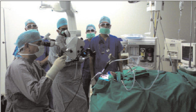
Figure 3: Conducting a LASER ENT case with safety precautions like goggles.

vendors was made at that time to import paediatric LASER flex tube and non-availability of the tube delayed the procedure for about 6 - 8 weeks. Family was counseled about anticipated number of surgical procedures, importance of specialized endotracheal tube for this surgery and complications, so the patient was discharged with tracheostomy tube in place.