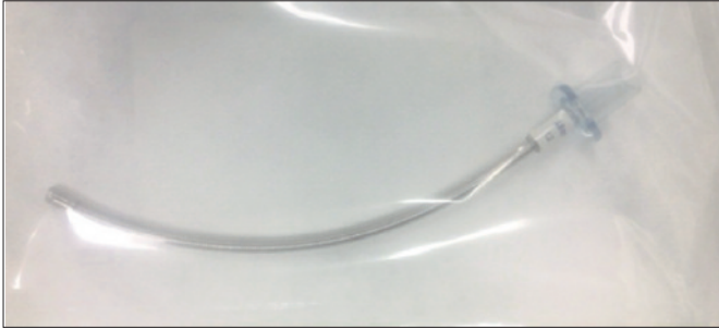
Figure 2: Paediatric LASER - flex endotracheal tube size 3.