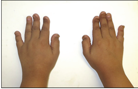
FIGURE 1: Broad hands with short, spoon shaped phalanges and dystrophic nails.

teeth". The patient had a marble bone disease and a history of multiple and recurrent bone fractures especially of the left midshaft tibia region which were treated conservatively. The last fracture occurred 6 months back due to fall during playing sports. On family history, elder brother also had similar condition while the parents were normal and healthy. The past medical history revealed growth hormone deficiency for which growth hormone injections were given till the age of 12 years.