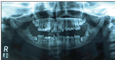
FIGURE 4: Panoramic radiographic findings.

the slow expansion technique, the next step followed was leveling and alignment of the maxillary teeth with comprehensive fixed mechanotherapy using Roth prescription 0.022 slot (Figure 7). At present, space creation for right and left maxillary second premolars is being performed using the push coil springs mechanics. Once the gross alignment of