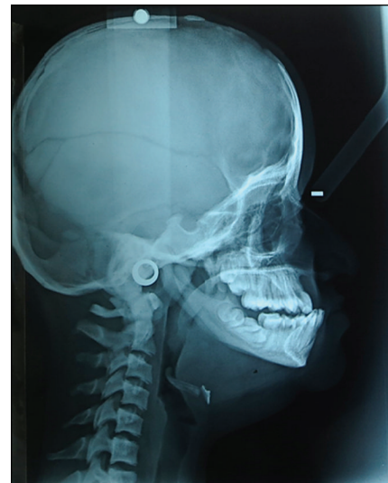
FIGURE 5: Cephalometric measurements and analysis.