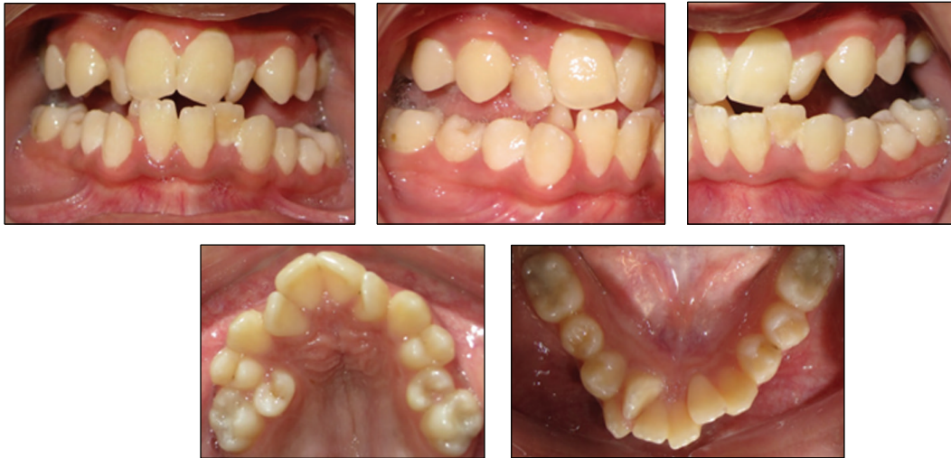
FIGURE 2: Intraoral features.