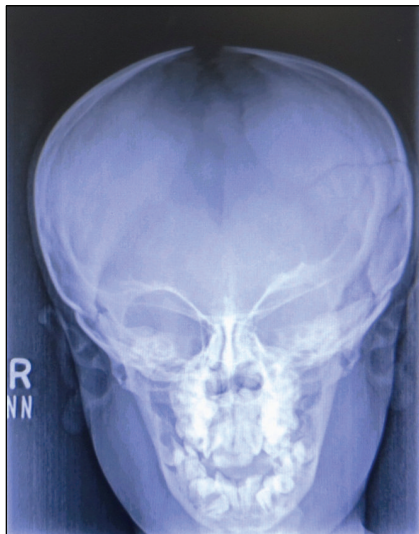
FIGURE 3: Skull radiograph with patent anterior fontanelle.