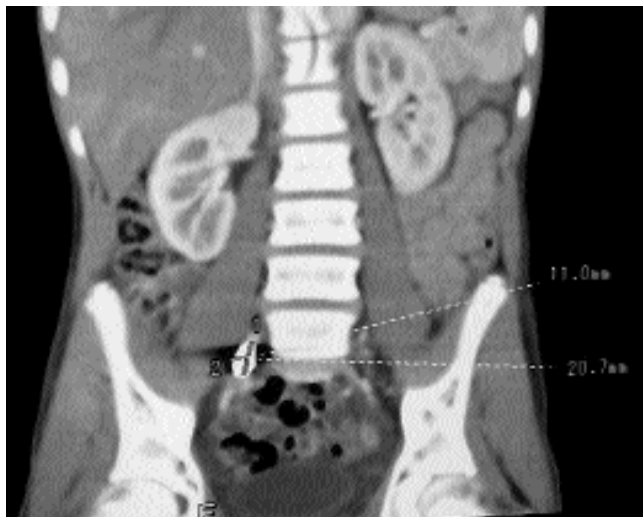
Figure-2: Bullet embolus seen lodged in the territory of the right common iliac vein in paravertebral region at L5-S1 level.

Sonography in Trauma (FAST) was negative.