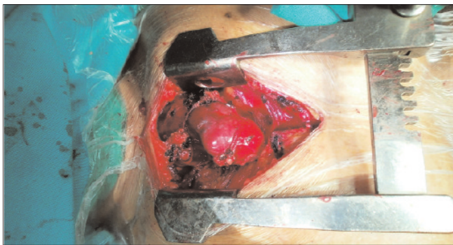
Figure 2: Intraoperative picture of the solid, elongated smooth surfaced mediastinal mass.

wound was closed in 2 layers. Patient was extubated within few hours of surgery and her postoperative recovery remained uneventful.