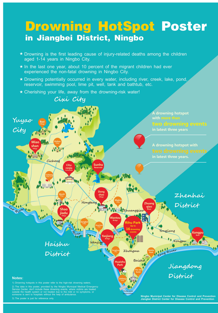
Fig. 2 The new drowning prevention poster with geo-located drowning events inserted here

of the intervention and control groups according to gender and school grade in the study sample. The percent of each group responding positively (i.e. yes) to the outcome variables were reported at baseline and follow-up for the intervention and control groups separately. Positive transition referred to the participants' belief conversion from "no" at baseline to "yes" at follow-up, and negative transition referred to a change in belief in the opposite direction. McNemar tests were used to examine change in outcomes within the intervention and control groups. Multilevel logistic regressions fitted with a two-way interaction between time and experimental grouping were used to assess the impact of the intervention on each outcome variable. For the first three outcomes, 'yes' was modelled as the response category. For the fourth outcome (on drowning hotspot avoidance), 'no' was modelled as the response category since the majority of the sample said 'yes'.