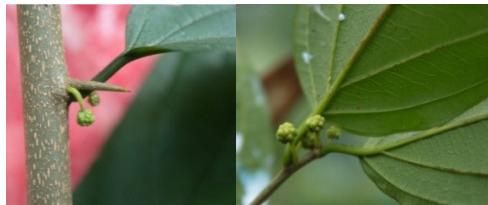
Figure 1: Maclura fruticosa.