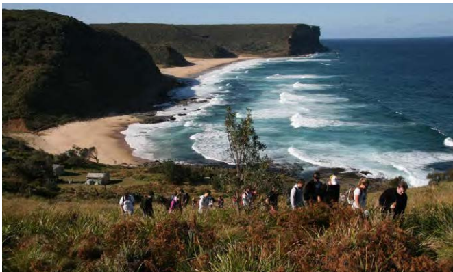
UOW fieldtrip, Illawarra coastal region

There are a lot of highlights in this degree, particular around the practical nature of the degree including field trips, internships, and major projects. Excitingly, there is opportunity to go abroad in the third year of study. For the next three years the international fieldwork will provide learning and teaching opportunities in Bali, Indonesia.