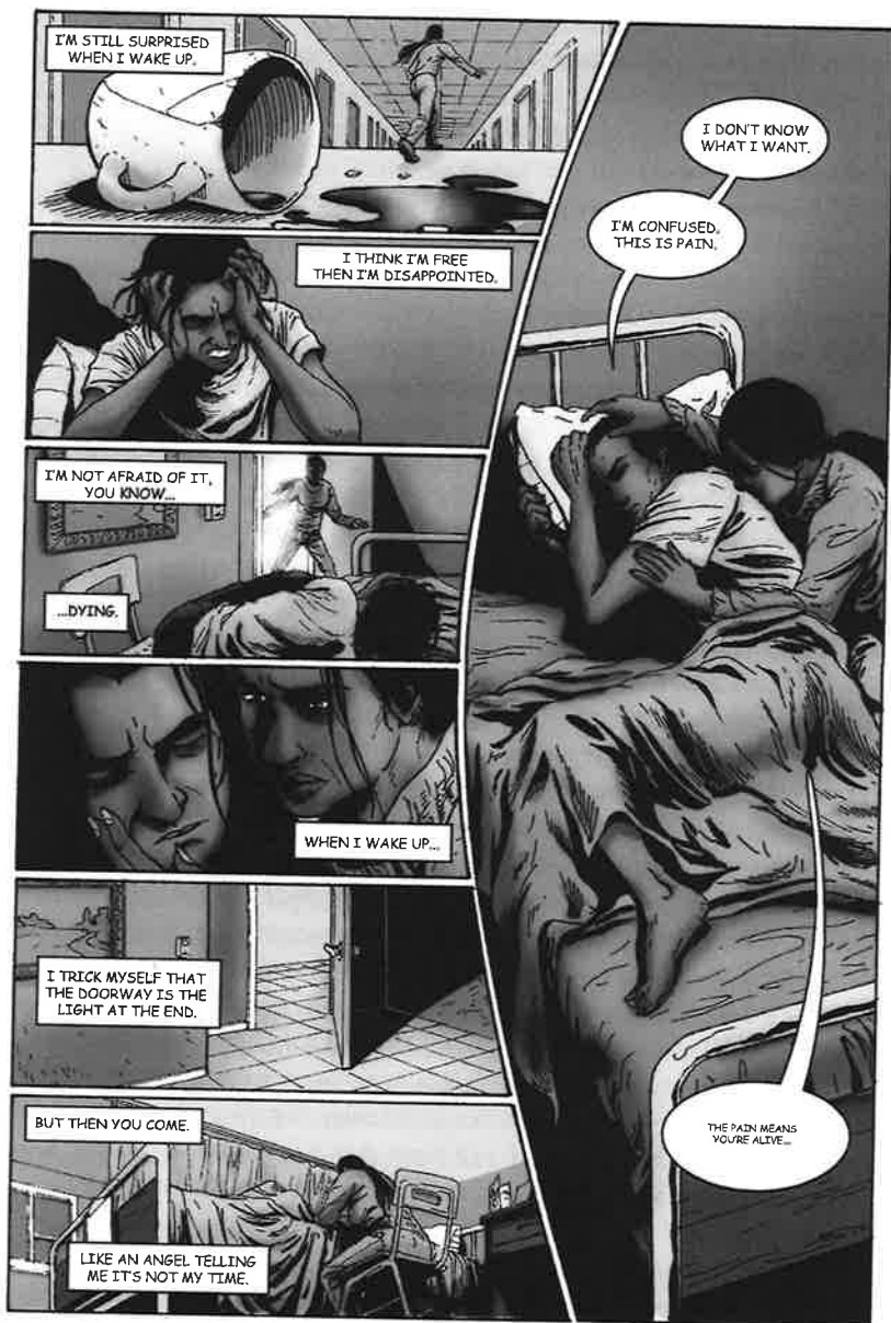
Figure 1. David Alexander Robinson, 7 Generations: A Plains Cree Saga (16-17).