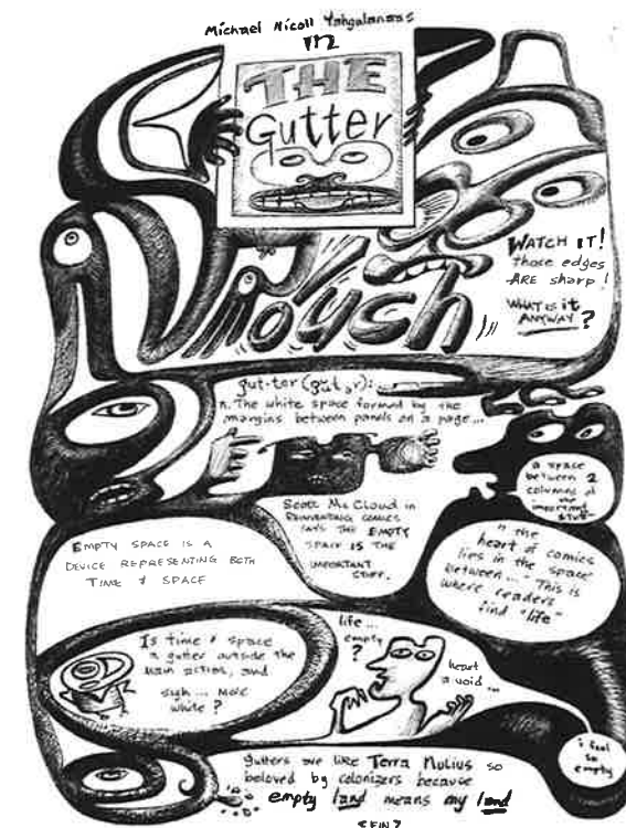
Figure 1. Michael Nicoll Yahgulanaas in The Gutter . Reprinted with permission of the artist.