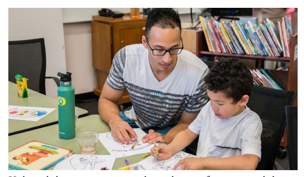
Kids and their parents enjoyed new boxes of crayons and the coloring pages we made just for this event.