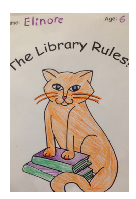
Some of our visitors shared their delightful artwork with us.