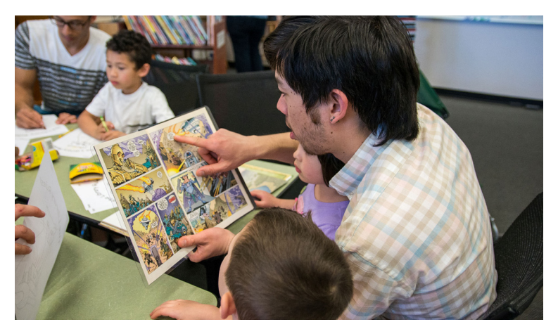
We had a wide range of books available for families to read, including Star Wars comics from the Library's Dark Horse Comics Collection.