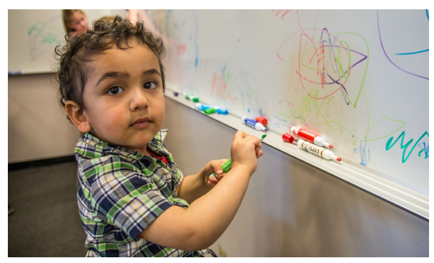
The whiteboards in the library classroom were very popular, especially with our littlest visitors.