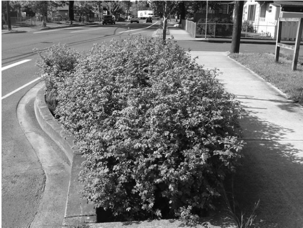
Figure 3 Bioswale extending into the road.

This is significant, since positive shifts in opinion seemed possible when the purpose and function of the devices was explained, face-to-face, in lay terms: