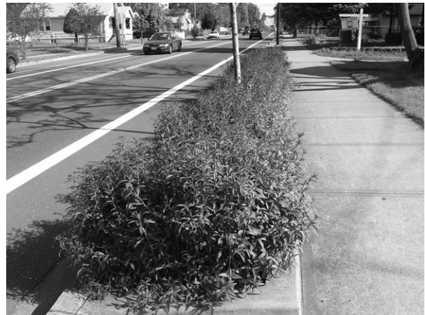
Figure 4 Bioswale not extending into the road.

'It occupies a traffic lane which is also a parking lane. So it's taking away traffic when it's designated to drive and parking in the evening. These are residential-