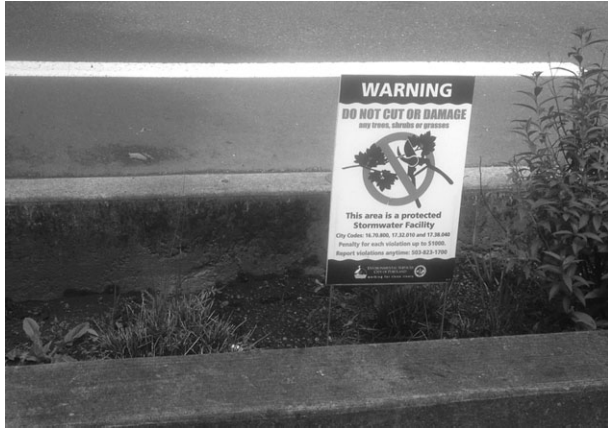
Figure 5 Incomplete bioswale with Bureau of Environmental Services sign warning against interference.

The city does have a volunteer Green Streets Stewards (GSS) programme, training people to know which plants should be in the bioswales and to trim and weed them (BES, 2012, 2013). Whilst they do not want untrained residents weeding (see Figure 5), they encourage people to clear out trash and debris to improve functionality (BES, 2012).