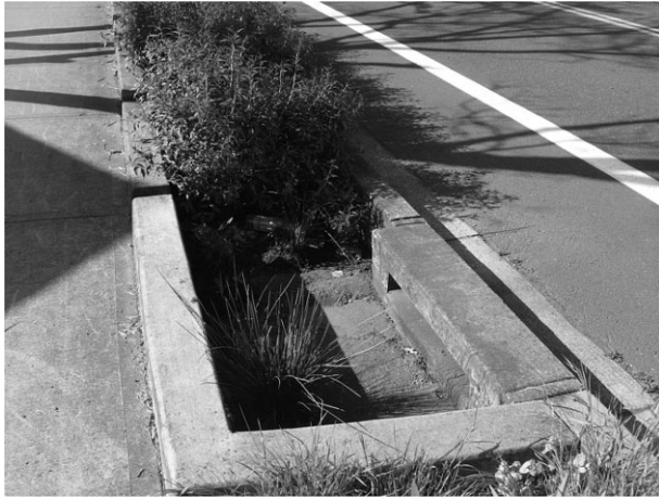
Figure 1 Incomplete bioswale showing water inlets.

scoring for sustainability efforts in Portney's (2013) review of US cities (see also Mayer and Provo, 2004).