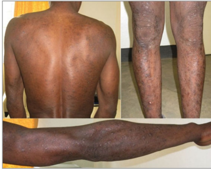
Fig 1. Papular pruritic eruption of HIV. This is characterized by symmetrically distributed pruritic, often excoriated, papules, which are most concentrated on the extensor aspects of the extremities but may also be generalized.