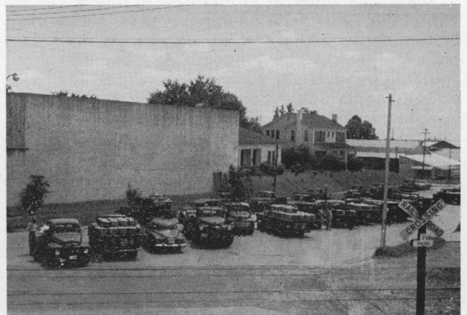
Figure 1. Tomato producers in the Northeast Sandy Lands area of Texas waiting to sell (left) and unload (right) their green-wrap tomatoes at a typical market.