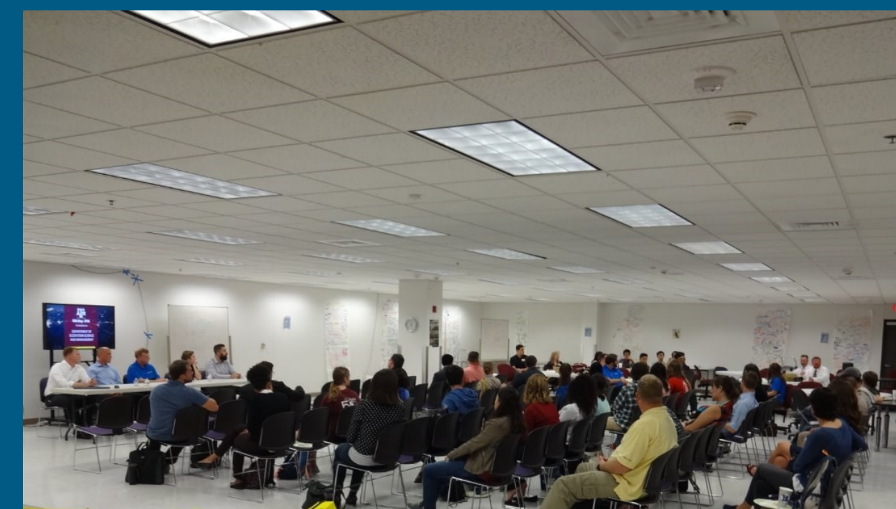
Alumni Panel, GIS Day 2016