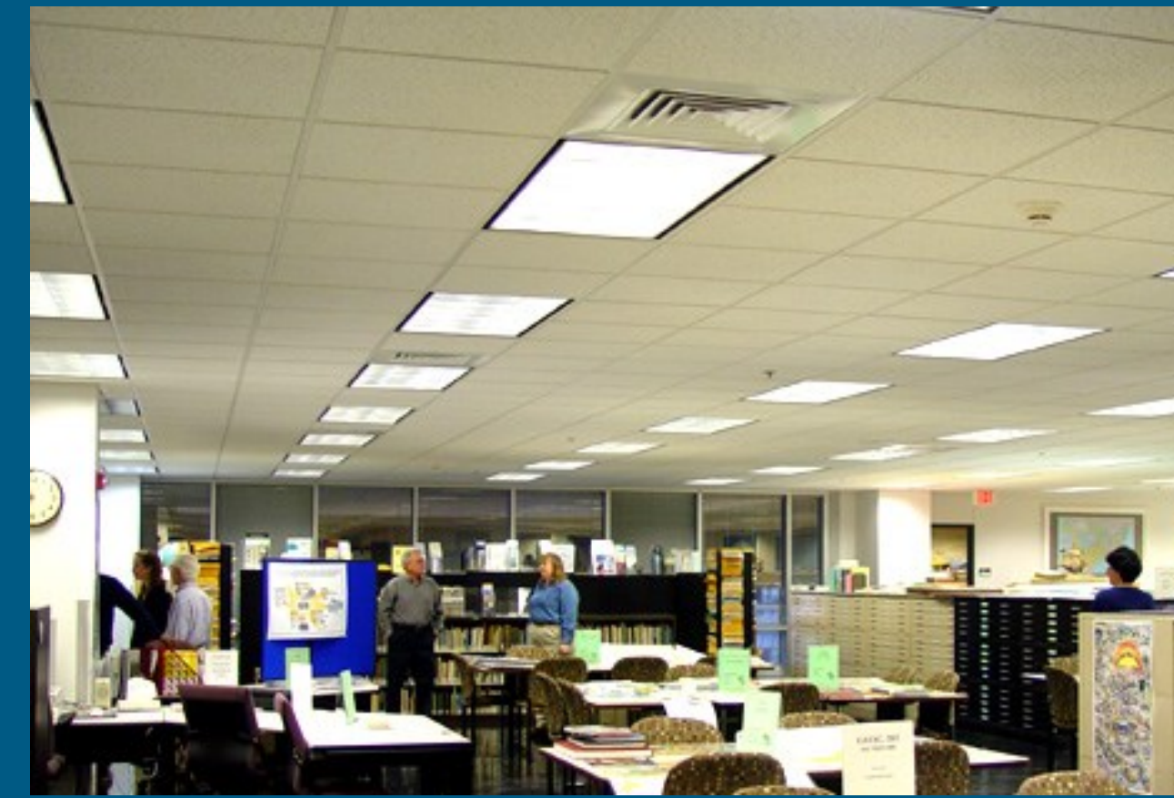
Open House, GIS Day 2005