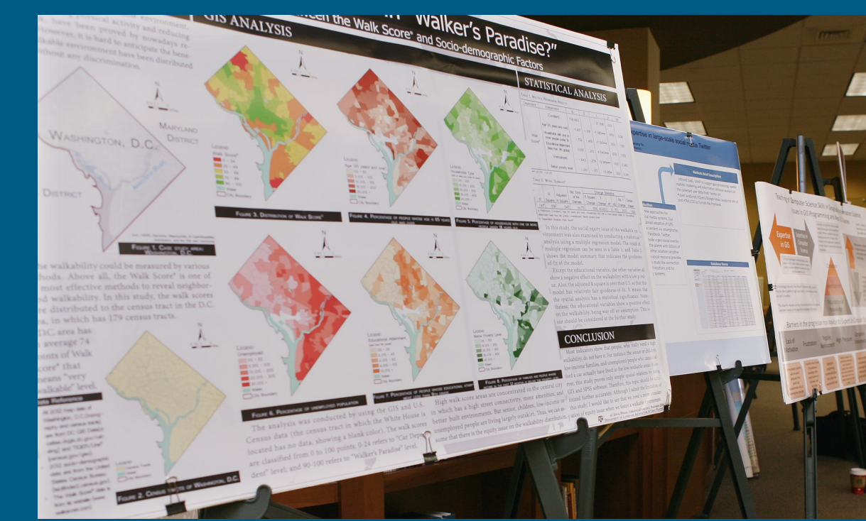
Poster Competition, GIS Day 2016