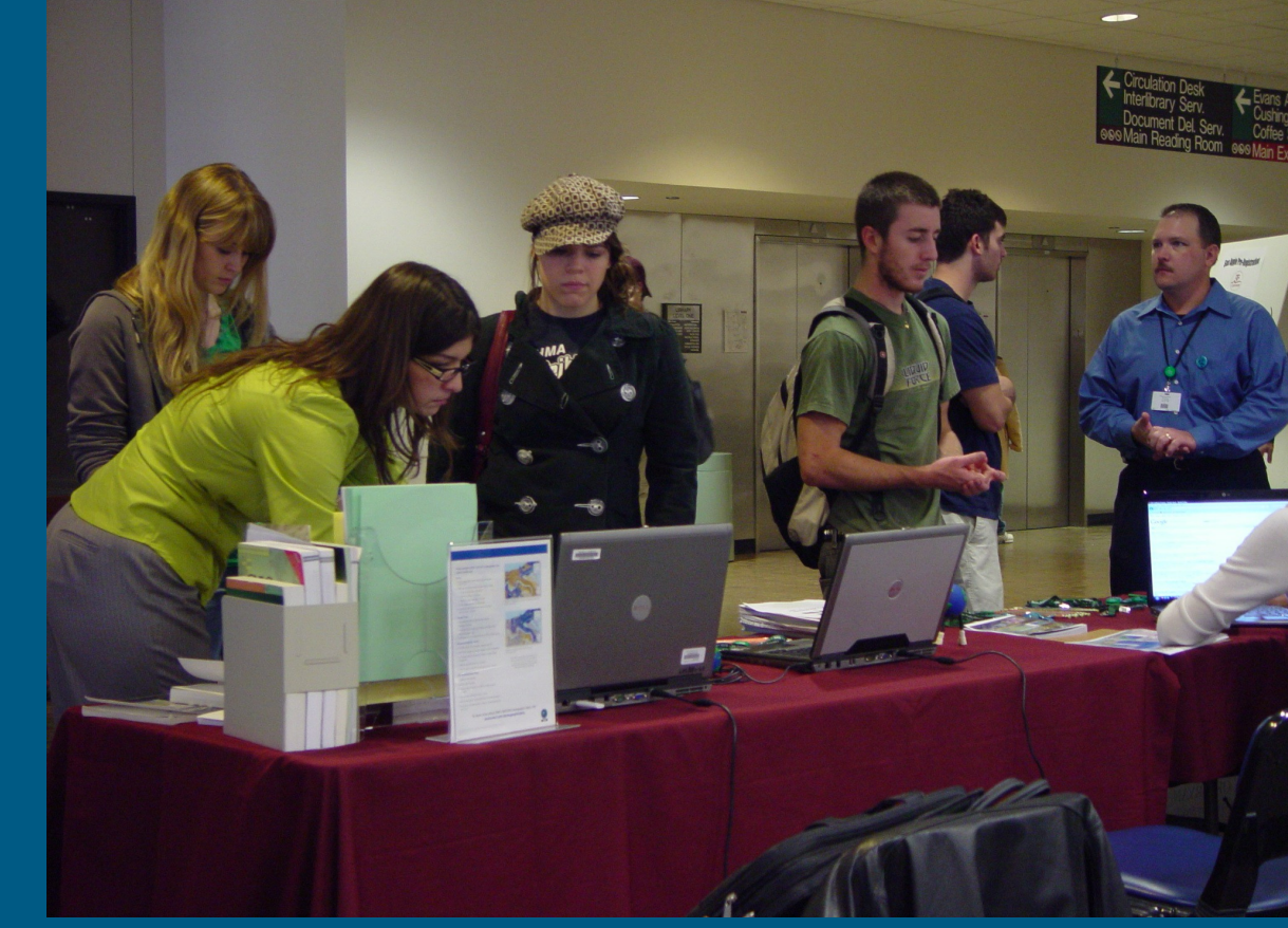
GIS Expo, GIS Day 2008