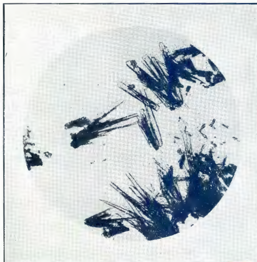
Fig. 4. Methyl ester of acid obtained by alkaline permanganate oxidation of Geigerin, M.P. 115.6°, \times 66 .

The substance appeared to react slowly with Brady's reagent forming a yellow precipitate.