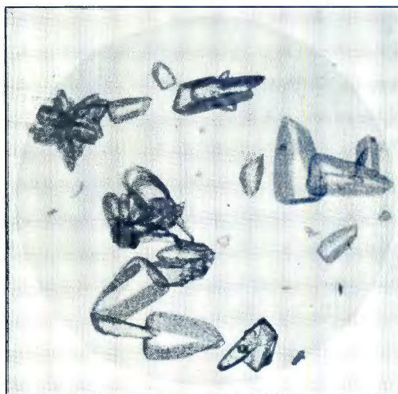
Fig. 1. Geigerin crystallised from water, \times 63 .