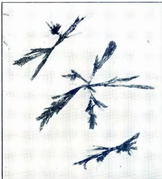
Fig. 3. Geigeric acid, M.P. 201–3°, ×70.

It is proposed to designate this substance "Geigeric acid".