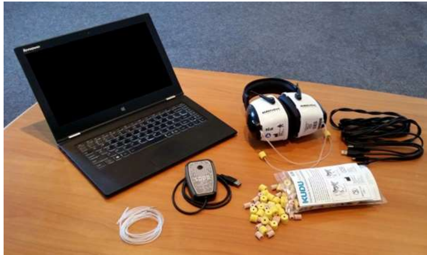
Fig. 1. KUDUwave 5000 Audiometer showing insert earphones, circumaural headphones, laptop computer and patient response button.

thresholds did not require masking. Bone conduction audiometry was not included in this test battery. Instead, otoscopy and patient history was used to distinguish conductive from sensorineural loss. The Pure Tone Average (PTA, 0.5, 1, 2 and 4 kHz) for each ear was recorded.