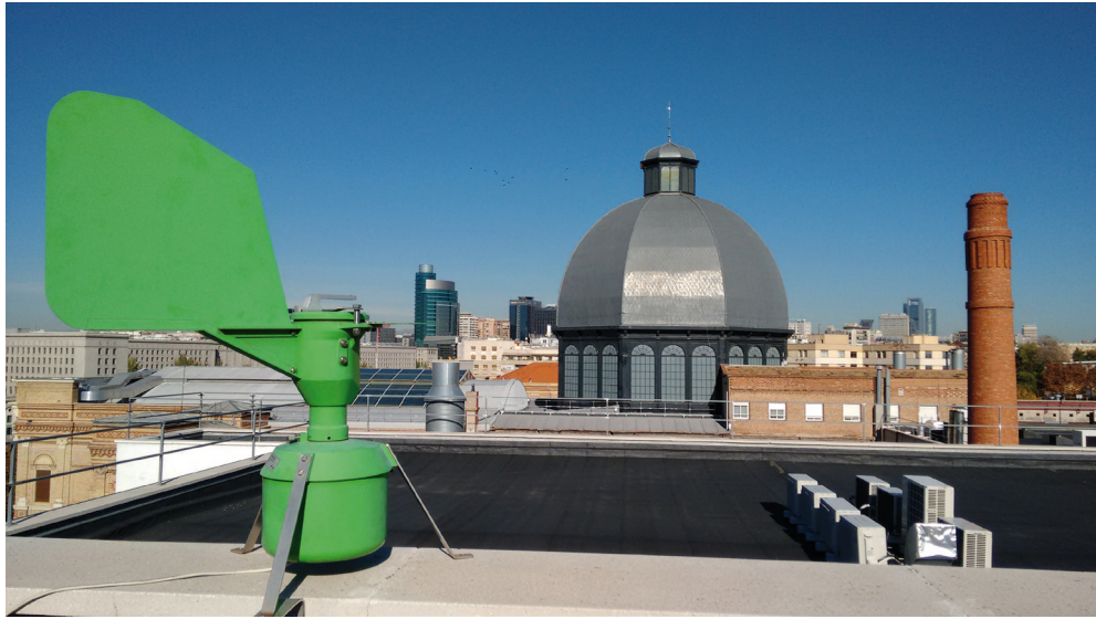
Fig. 1. Air collector placed on the roof of the Higher Technical School of Industrial Engineering, Madrid. The octagonal dome, 42 m high, was built in 1881–1887, originally to host the Palace of Arts and Industry of Madrid. The School was located in the building in 1907. (See cover and page A2 of this issue.)

logical particles to be non-significant as a source of IN at global scale [51]. Even so, biological particles may be important at altitudes between 4 and 7 km, where the contribution of IN of biological origin becomes dominant at temperatures warmer than -15^{\circ}\text{C} whereas mineral dust particles are typically considered to be the major contributor below this temperature [24,66].