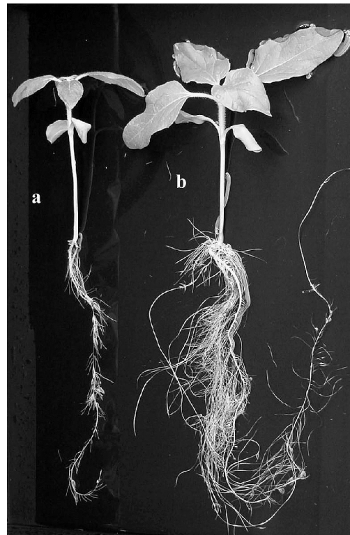
Figure 2. Sunflower plants grown in complete nutrient solution: a) 0.00625 mg L -1 of boron; b) 0.15 mg L -1 of boron.

consequence of the greater variation for the symptoms in the same cultivar – and, therefore, with a greater associated error given by the high coefficient of variation (CV = 77.7%).