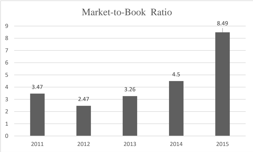
Figure 2. Average Market-to-Book Ratio of IT firms listed in China

China's reform begins from over three decades ago. IT industry is one of earliest areas that start market-oriented reforms. In 1983, China's government planned to triple the output of