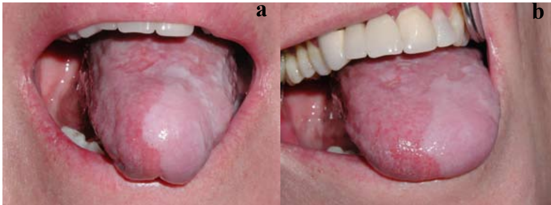
Fig. 2. Without changes after treatment with retinoids. a: before treatment. b: after treatment.