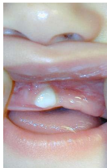
Fig. 3. Healing after one month.