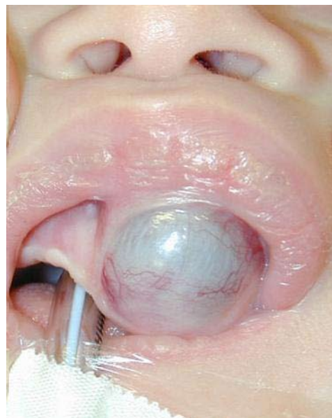
Fig. 1. Clinical view of the tumour.

The surgical excision was performed under general anesthesia. The tooth buds of 6.1 and 6.2 were closely related to the tumour and so were removed. The lesion was entirely enucleated. A second curettage was performed to eliminate in particular a dark coloured area of bone around the tooth bud of 6.3. The patient's recovery was uneventful. There were no post-operative complications and no clinical recurrence (Fig. 3).