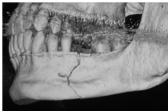
Fig. 2. 3D reconstruction of the CT confirmed the presence of a non dislocated fracture in the left body of the mandible.