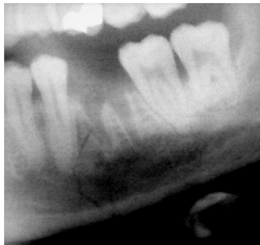
Fig. 1. A.- Panoramic radiograph showing an atypical angular course of the pathological mandibular fracture.

An open reduction, internal fixation by plate osteosynthesis and additional mandibulomaxillary fixation (MMF) were performed under general anaesthesia. On postoperative day 15, MMF was released. Soft diet was prescribed for one month. The patient showed uneventful bone healing following treatment. No signs of osteonecrosis or nonunion were observed after seven months of follow-up.