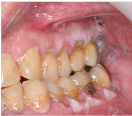
Fig. 2. PVL lesions on keratinized mucosa.