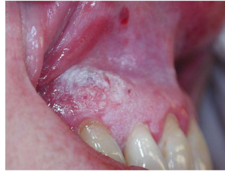
Fig. 5. Wide lesion with a confirmed diagnosis of squamous cell carcinoma.