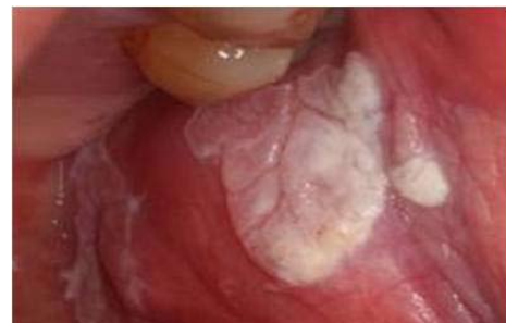
Fig. 6. Verrucous aspect of a large lesion which is not alone.