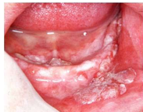
Fig. 8. Note the coexistence of lesions at various stages of evolution in the same PVL case.