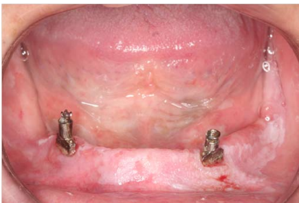
Fig. 3. Multiple lesions at different stages of evolution.