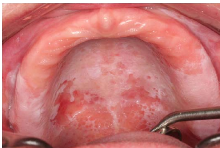
Fig. 4. Multiple white lesions next to erythematized lesions on the masticatory mucosa.