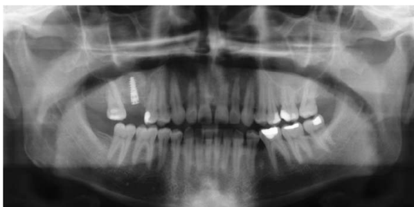
Fig. 3. Panoramic radiography before second stage.