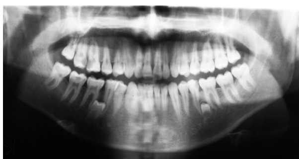
Fig. 3. Panoramic radiograph of patient aged 18 years. All permanent teeth are present plus early crown formation of two supernumerary teeth in the lower premolar region bilaterally. The supernumerary premolar that was found on the right lower jaw in this patient, has led to the root resorption of the lower right second premolar.