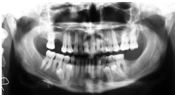
Fig. 1. Panoramic radiograph of patient aged 39 years. This patient has four supernumerary premolars in the mandible and one in the maxilla.