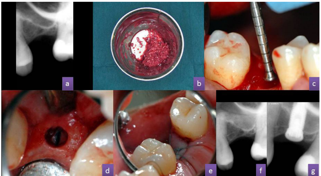
Fig. 2. (A) Preoperative periapical X-ray, (b) Mixing blood collected from the edges of the incision with augmentation material (Biogen™, Bioteck, Italy) (c) TKW5 tip, also called 'Trumpet', (d) Hole created on the ridge for subsequent use of a TKW5 tip, (e) 4/0 silicone-coated polyester suture, (f) Periapical X-ray of maxillary sinus with augmentation material inserted, (g) Periapical X-ray of the maxillary sinus with augmentation material and implant in place.