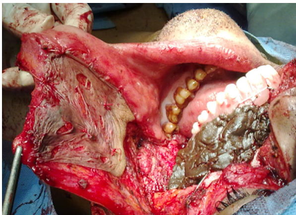
Fig. 2. A split thickness skin graft was applied under the soft tissue flap to line the surgically produced cavity especially the cheek row area.

immediate surgical obturation, to be used later as anchorage for prosthesis.