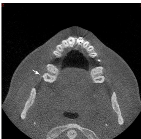
Fig. 1. Axial image of enamel pearl localized at the cemento-enamel junction on the vestibule side of a right maxillary second molar.