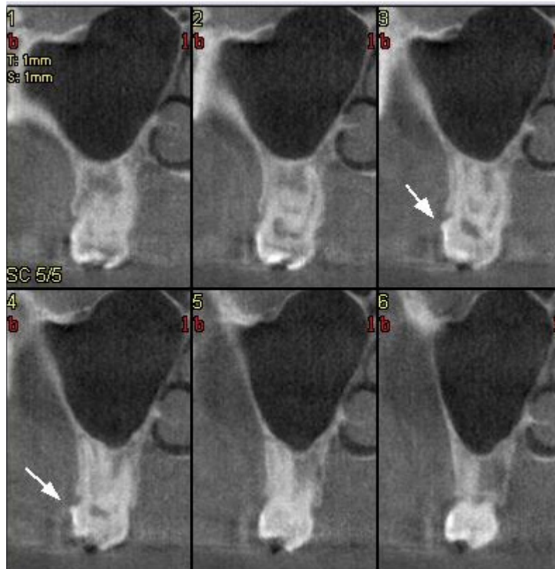
Fig. 2. Sequential cross-sectional view of enamel pearl.