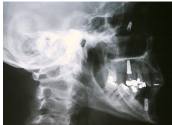
Fig. 2. Lateral cephalogram showing an endosseous implant.