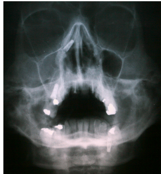
Fig. 1. Oblique frontal cephalogram showing upper metallic foreign body and right maxillary sinus total occupation.

The correct diagnosis is based on: history of previous implantology surgery, clinical exploration and radiological findings. Radiological techniques show location and size of the metallic foreign body, and so panoramic radiography is commonly used at dental clinics; however, with lateral and oblique frontal cephalograms (Fig. 1, Fig. 2) and computerized tomography (Fig. 3) the exact location of