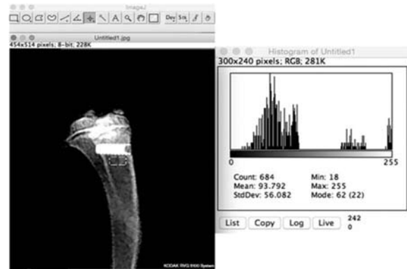
Fig. 2. Radiological view and radiodensitometric analysis of the micro-implant.

areas of equal width that were selected from the medullary bone areas that were adjacent to implant’s apical 3 grooves. The software’s histogram property, which expresses the light distribution of the digital image in one graph, was used to obtain the mean BMD values of each sample (Fig. 2).