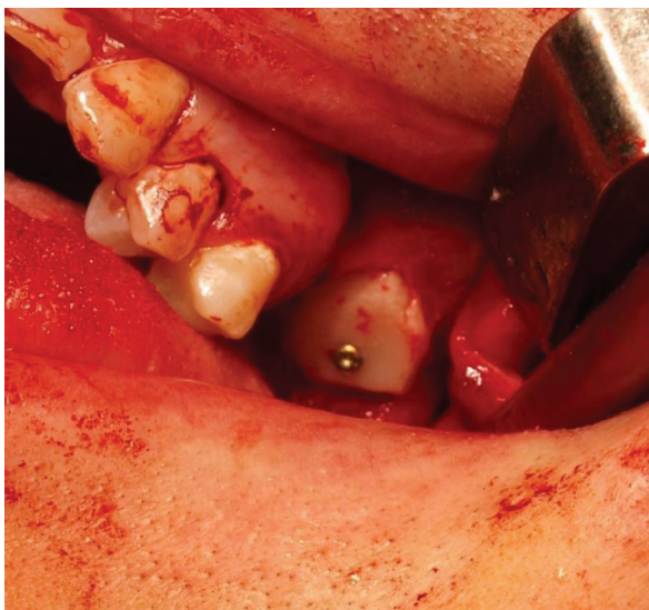
Fig. 3. Bone graft fixed bicortical screw.

The healing process of soft tissue in the post-operative area, temporary sensory disturbances, unveiling of the aggregating element, loss of graft stability, occurrence of a secondary oroantral fistula were also assessed. The follow-up was conducted 2 weeks after surgery and then again 3 and 6 months after surgery.