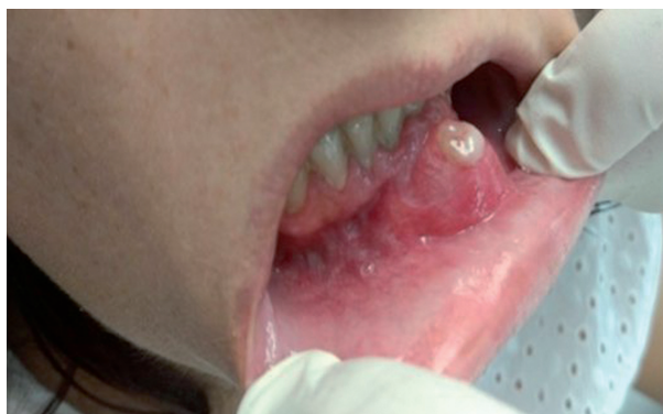
Fig. 1: Clinical image of mandibular chondrosarcoma. Patient referred a rapid growth of the injury. She noted a small lump three or four weeks before. The aggressiveness of the lesion is evident.

More in detail, the patient referred the onset of a painless lump in the mandibular symphysis at the emergency department of our hospital. The lesion appeared spontaneously a few weeks earlier. No trismus, paresthesia or other symptoms were reported by the patient. At the exploration, the mass was fixed to the jaw without mobility. Moreover, the patient related a rapid growth (Fig. 1). Against this backdrop, the emergency physician aler-