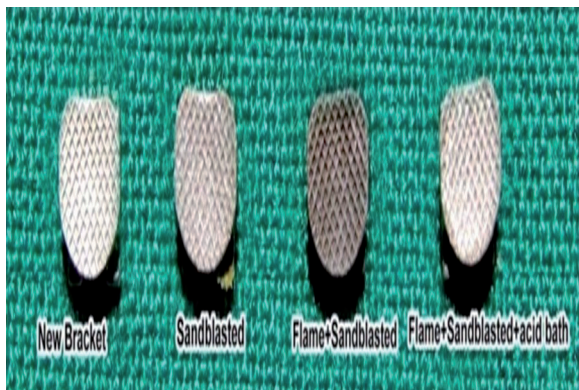
Fig. 4: Appearance of the new and recycled bracket mesh bases.

In our study Group II sandblasted with 90 \mu m showed higher bond strength among the recycling methods employed. Tavares SW showed that bracket recycling using 90- \mu m aluminum oxide particle air abrasion enhances bracket bonding to tooth structure by micromechanical retention on base surface and hence increases bond strength compared to 50 \mu m aluminum oxide particle air abrasion. 6 In our study sandblasting was done with 90 \mu m aluminium oxide abrasion which produced greater micro-roughness on bracket base surface, increasing considerably the area available for bracket attachment which resulted in highest bond strength among the recycling methods.