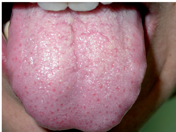
Fig. 1. Multiple erythematous enlarged fungiform papillae on the anterior tongue dorsum (#7).

allergic reaction, while all denied regular use of antiseptic mouthwashes. Three patients (cases #2, #4 and #8) reported “geographic tongue” that was present at the time of examination in one of them (case #2). Habitual lingual trauma was reported by 2 patients (cases #7 and #10), although in 3 more patients (cases #1, #3 and #11) a diffuse erythematous area on the tip of tongue was indicative of tongue thrusting. In case #1 tongue thrusting on an upper fixed orthodontic appliance was con-