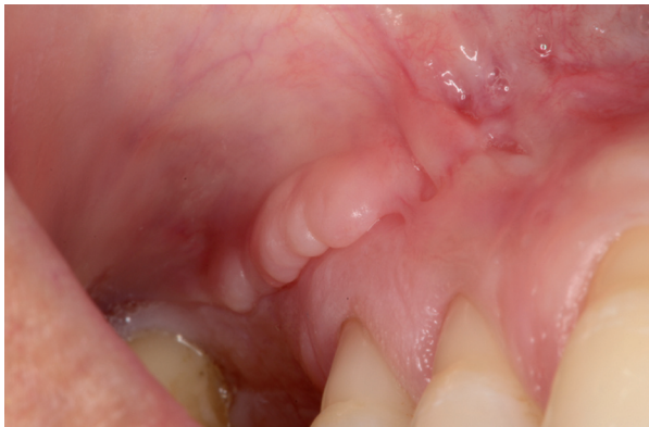
Fig. 3. Three-months follow up.

The postoperative period was uneventful and suture was removed after 15 days. At 3 months' follow-up, the patient did not refer any symptoms and the OAC was completely closed (Fig. 3).