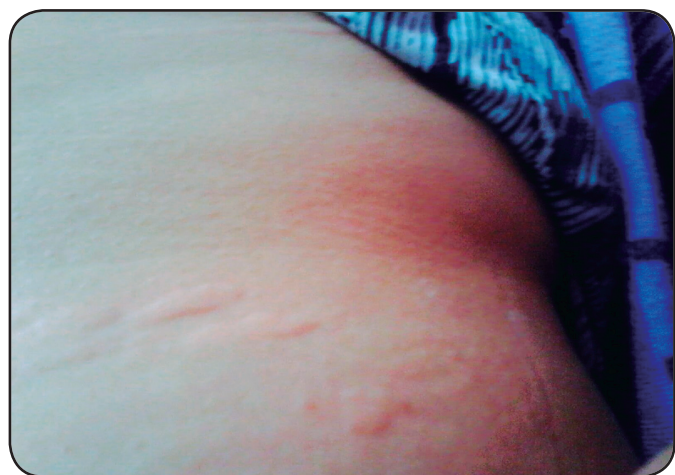
FIGURE 1 - Erythematous lesions in abdomen and indurated plaque in the left axilla and lateral side of the chest. Eight days after the beginning of treatment with benznidazole.

treatment with hydroxyzine (25mg at night-time), an extra dose of cetirizine (10mg after 12 hours if the pruritus was persistent), and prednisolone (30mg for 3 days, followed by a reduction of 10mg every 3 days over 9 days of treatment).